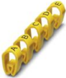
Conductor marking collar, labeled with the capital letter: Letters, white, width: 6.2 mm

Please be informed that the data shown in this PDF Document is generated from our Online Catalog. Please find the complete data in the user's documentation. Our General Terms of Use for Downloads are valid ( http://phoenixcontact.com/download )