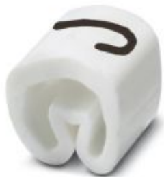
Conductor marking collar, labeled with the capital letter: Letters, white, width: 3.2 mm

Please be informed that the data shown in this PDF Document is generated from our Online Catalog. Please find the complete data in the user's documentation. Our General Terms of Use for Downloads are valid ( http://phoenixcontact.com/download )