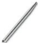
Alignment tool for cable markers, Bare metallic, mounting type: thread on, cable diameter range: 2.5 ... 16 mm

Alignment tool for cable markers - SD-WMS 5 TOOL - 0826475