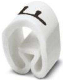
Conductor marking collar, labeled with the capital letter: Letters, white, width: 3.2 mm

Please be informed that the data shown in this PDF Document is generated from our Online Catalog. Please find the complete data in the user's documentation. Our General Terms of Use for Downloads are valid ( http://phoenixcontact.com/download )