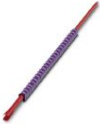
Conductor marking collar, Labeled with the number: Numbers, violet, width: 3.2 mm

Please be informed that the data shown in this PDF Document is generated from our Online Catalog. Please find the complete data in the user's documentation. Our General Terms of Use for Downloads are valid ( http://phoenixcontact.com/download )