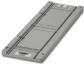
Magazine, for CMS-P1-PLOTTER and PLOTMARK, for accommodating UC-TMF..., UC1-TMF..., UC-WMT...

Please be informed that the data shown in this PDF Document is generated from our Online Catalog. Please find the complete data in the user's documentation. Our General Terms of Use for Downloads are valid ( http://phoenixcontact.com/download )