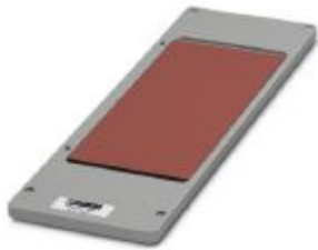
Plastic magazine for CMS-P1 plotter. For accommodating 1 GPE lable sheet

Please be informed that the data shown in this PDF Document is generated from our Online Catalog. Please find the complete data in the user's documentation. Our General Terms of Use for Downloads are valid ( http://phoenixcontact.com/download )