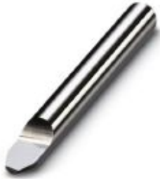
Fully hard metal chisel, 1 cutting edge, cutting width: 0.3 mm

Please be informed that the data shown in this PDF Document is generated from our Online Catalog. Please find the complete data in the user's documentation. Our General Terms of Use for Downloads are valid ( http://phoenixcontact.com/download )