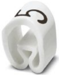
Conductor marking collar, Labeled with the number: Numbers, white, width: 3.2 mm

Please be informed that the data shown in this PDF Document is generated from our Online Catalog. Please find the complete data in the user's documentation. Our General Terms of Use for Downloads are valid ( http://phoenixcontact.com/download )