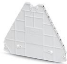
End cover, length: 100 mm, width: 2.2 mm, height: 80.8 mm, color: white

Please be informed that the data shown in this PDF Document is generated from our Online Catalog. Please find the complete data in the user's documentation. Our General Terms of Use for Downloads are valid ( http://phoenixcontact.com/download )