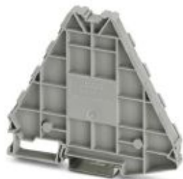
Spacer plate, length: 100 mm, width: 8.3 mm, height: 86 mm, color: gray

Please be informed that the data shown in this PDF Document is generated from our Online Catalog. Please find the complete data in the user's documentation. Our General Terms of Use for Downloads are valid ( http://phoenixcontact.com/download )