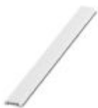
Zack marker strip, Strip, white, labeled, mounting type: snap into flat marker groove, for terminal block width: 6.2 mm, lettering field size: 6.15 x 10.5 mm

Zack marker strip - ZBF 6/9,2 S8 CUS - 8191575