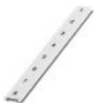
Zack marker strip, Strip, white, labeled, can be labeled with: CMS-P1-PLOTTER, mounting type: snap into tall marker groove, for terminal block width: 6.2 mm, lettering field size: 10.5 x 6 mm

Zack marker strip - ZBF 6/9,2 S8,QR:1-8 - 0803448