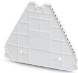
End cover, length: 100 mm, width: 2.2 mm, height: 80.8 mm, color: white

Please be informed that the data shown in this PDF Document is generated from our Online Catalog. Please find the complete data in the user's documentation. Our General Terms of Use for Downloads are valid ( http://phoenixcontact.com/download )