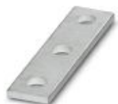
Connection rail, number of positions: 3, color: silver