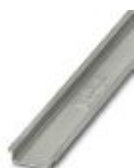
DIN rail, unperforated, Standard profile, width: 35 mm, height: 7.5 mm, acc. to EN 60715, material: Steel, galvanized, passivated with a thick layer, length: 2000 mm, color: silver

DIN rail, unperforated - NS 35/ 7,5 UNPERF 2000MM - 0801681