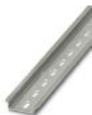
DIN rail perforated, Standard profile, width: 35 mm, height: 7.5 mm, acc. to EN 60715, material: Steel, galvanized, passivated with a thick layer, length: 2000 mm, color: silver

DIN rail perforated - NS 35/ 7,5 PERF 2000MM - 0801733