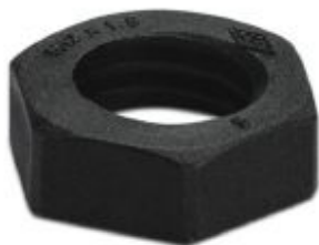
Nut, height: 5 mm, color: black

Please be informed that the data shown in this PDF Document is generated from our Online Catalog. Please find the complete data in the user's documentation. Our General Terms of Use for Downloads are valid ( http://phoenixcontact.com/download )