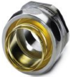
Cable gland made from brass with metric thread, IP65 protection

Please be informed that the data shown in this PDF Document is generated from our Online Catalog. Please find the complete data in the user's documentation. Our General Terms of Use for Downloads are valid ( http://phoenixcontact.com/download )