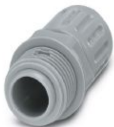
Cable gland made from PP with metric thread, rotatable, IP54 protection

Please be informed that the data shown in this PDF Document is generated from our Online Catalog. Please find the complete data in the user's documentation. Our General Terms of Use for Downloads are valid ( http://phoenixcontact.com/download )