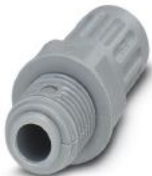
Cable gland made from PP with Pg thread, rotatable, IP54 protection

Please be informed that the data shown in this PDF Document is generated from our Online Catalog. Please find the complete data in the user's documentation. Our General Terms of Use for Downloads are valid ( http://phoenixcontact.com/download )