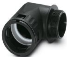
Cable gland, metric thread, IP68/69k protection, angled

Please be informed that the data shown in this PDF Document is generated from our Online Catalog. Please find the complete data in the user's documentation. Our General Terms of Use for Downloads are valid ( http://phoenixcontact.com/download )