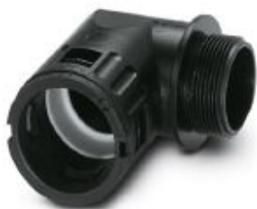
Cable gland, metric thread, IP68/69k protection, angled

Please be informed that the data shown in this PDF Document is generated from our Online Catalog. Please find the complete data in the user's documentation. Our General Terms of Use for Downloads are valid ( http://phoenixcontact.com/download )