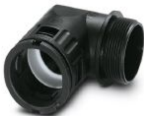
Cable gland, Pg thread, IP68/69k protection, angled

Please be informed that the data shown in this PDF Document is generated from our Online Catalog. Please find the complete data in the user's documentation. Our General Terms of Use for Downloads are valid ( http://phoenixcontact.com/download )