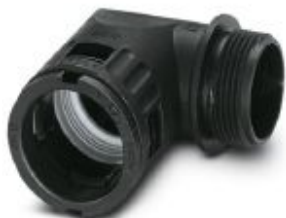
Cable gland, Pg thread, IP68/69k protection, angled

Please be informed that the data shown in this PDF Document is generated from our Online Catalog. Please find the complete data in the user's documentation. Our General Terms of Use for Downloads are valid ( http://phoenixcontact.com/download )