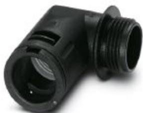
Cable gland, Pg thread, IP68/69k protection, angled

Please be informed that the data shown in this PDF Document is generated from our Online Catalog. Please find the complete data in the user's documentation. Our General Terms of Use for Downloads are valid ( http://phoenixcontact.com/download )