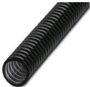
Galvanized steel protective hose with PVC coating

Please be informed that the data shown in this PDF Document is generated from our Online Catalog. Please find the complete data in the user's documentation. Our General Terms of Use for Downloads are valid ( http://phoenixcontact.com/download )