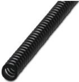
Galvanized steel protective hose with PVC coating

Please be informed that the data shown in this PDF Document is generated from our Online Catalog. Please find the complete data in the user's documentation. Our General Terms of Use for Downloads are valid ( http://phoenixcontact.com/download )