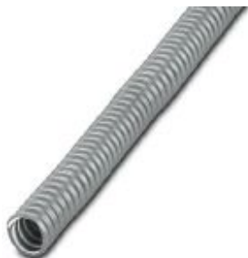
Protective hose, spring steel wire with PVC coating, highly stranded

Please be informed that the data shown in this PDF Document is generated from our Online Catalog. Please find the complete data in the user's documentation. Our General Terms of Use for Downloads are valid ( http://phoenixcontact.com/download )