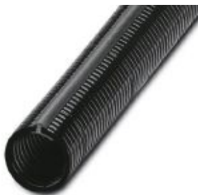
Polyamide protective hose, inflammability class V0, UV resistant

Please be informed that the data shown in this PDF Document is generated from our Online Catalog. Please find the complete data in the user's documentation. Our General Terms of Use for Downloads are valid ( http://phoenixcontact.com/download )