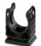
Hose holder with cover

Hose holder with cover - WP-BASE C PA HF 21,2 BK - 3240961