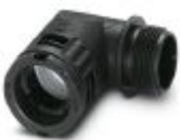
Cable gland, Pg thread, IP68/69k protection, angled

Screw connection - WP-GA HF IP69K PG16 BK - 3240905