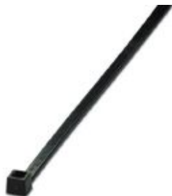
Cable binders for quick and secure bundling, standard version

Please be informed that the data shown in this PDF Document is generated from our Online Catalog. Please find the complete data in the user's documentation. Our General Terms of Use for Downloads are valid ( http://phoenixcontact.com/download )