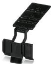
Universal wire holding bracket, perforated, for wiring channels

Please be informed that the data shown in this PDF Document is generated from our Online Catalog. Please find the complete data in the user's documentation. Our General Terms of Use for Downloads are valid ( http://phoenixcontact.com/download )