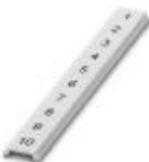
Zack Marker strip, flat, Strip, white, labeled, Printed vertically: consecutive numbers 1 ... 10, 11 ... 20, etc. up to 91 ... 100, mounting type: snap into flat marker groove, for terminal block width: 5 mm, lettering field size: 5.15 x 5.15 mm, Number of individual labels: 10

Zack Marker strip, flat - ZBF 5,QR:FORTL.ZAHLEN - 0808697