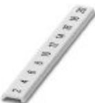
Zack Marker strip, flat, Strip, white, labeled, printed horizontally: consecutive numbers 2 ... 20, 22 ... 40, etc. up to 82 ... 100, mounting type: snap into flat marker groove, for terminal block width: 5 mm, lettering field size: 5.15 x 5.15 mm, Number of individual labels: 10

Zack Marker strip, flat - ZBF 5,LGS:GERADE ZAHLEN - 0810821