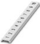
Zack Marker strip, flat, Strip, white, labeled, printed horizontally: consecutive numbers 1 ... 10, 11 ... 20, etc. up to 491 ... 500, mounting type: snap into flat marker groove, for terminal block width: 5 mm, lettering field size: 5.15 x 5.15 mm, Number of individual labels: 10

Zack Marker strip, flat - ZBF 5,LGS:FORTL.ZAHLEN - 0808671