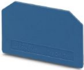
End cover, length: 46.2 mm, width: 1 mm, height: 28.3 mm, color: blue

Please be informed that the data shown in this PDF Document is generated from our Online Catalog. Please find the complete data in the user's documentation. Our General Terms of Use for Downloads are valid ( http://phoenixcontact.com/download )