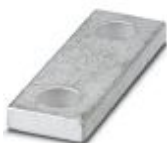
Connection rail, number of positions: 2, color: silver