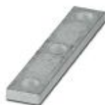
Connection rail, number of positions: 3, color: silver