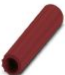
Insulating sleeve, color: red