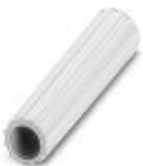
Insulating sleeve, color: white