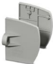
Flange, number of positions: 0, color: gray

Please be informed that the data shown in this PDF Document is generated from our Online Catalog. Please find the complete data in the user's documentation. Our General Terms of Use for Downloads are valid ( http://phoenixcontact.com/download )