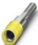
Female test connector, color: yellow

Female test connector - PSBJ 4/15/6 YE - 0303367