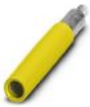
Female test connector, color: yellow

Female test connector - PSBJ-URTK 6 YE - 3026405