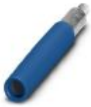
Female test connector, color: blue

Female test connector - PSBJ-URTK 6 BU - 3026434