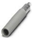
Female test connector, color: gray

Female test connector - PSBJ-URTK 6 GY - 3026612