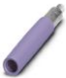
Female test connector, color: violet

Female test connector - PSBJ-URTK 6 VT - 3026421