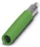
Female test connector, color: green

Female test connector - PSBJ-URTK 6 GN - 3026418