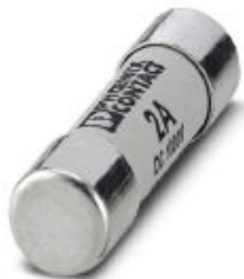
Fuse, 10.3x38 mm, up to 1000 V DC, gPV characteristics

Please be informed that the data shown in this PDF Document is generated from our Online Catalog. Please find the complete data in the user's documentation. Our General Terms of Use for Downloads are valid ( http://phoenixcontact.com/download )