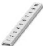
Zack Marker strip, flat, Strip, white, labeled, printed horizontally: consecutive numbers 1 ... 10, 11 ... 20, etc. up to 491 ... 500, mounting type: snap into flat marker groove, for terminal block width: 5 mm, lettering field size: 5.15 x 5.15 mm, Number of individual labels: 10

Zack Marker strip, flat - ZBF 5,LGS:FORTL.ZAHLEN - 0808671