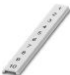
Zack Marker strip, flat, Strip, white, labeled, Printed vertically: consecutive numbers 1 ... 10, 11 ... 20, etc. up to 91 ... 100, mounting type: snap into flat marker groove, for terminal block width: 5 mm, lettering field size: 5.15 x 5.15 mm, Number of individual labels: 10

Zack Marker strip, flat - ZBF 5,QR:FORTL.ZAHLEN - 0808697