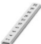
Zack Marker strip, flat, Strip, white, labeled, printed horizontally: consecutive numbers 2 ... 20, 22 ... 40, etc. up to 82 ... 100, mounting type: snap into flat marker groove, for terminal block width: 5 mm, lettering field size: 5.15 x 5.15 mm, Number of individual labels: 10

Zack Marker strip, flat - ZBF 5,LGS:GERADE ZAHLEN - 0810821