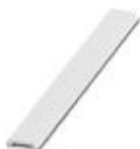
Zack Marker strip, flat, can be ordered: Strip, white, labeled according to customer specifications, mounting type: snap into flat marker groove, for terminal block width: 5 mm, lettering field size: 5.15 x 5.15 mm, Number of individual labels: 10

Zack Marker strip, flat - ZBF 5 CUS - 0825025