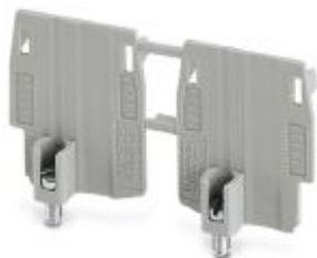
Flange cover, snap onto the UP 6/... plugs, length: 21 mm, width: 4.5 mm, height: 24.7 mm, color: gray

Please be informed that the data shown in this PDF Document is generated from our Online Catalog. Please find the complete data in the user's documentation. Our General Terms of Use for Downloads are valid ( http://phoenixcontact.com/download )