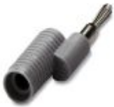
Reducing plug, color: gray