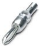
Test plugs, with solder connection up to 1 mm 2 conductor cross section, color: gray