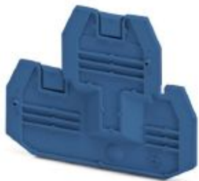
End cover, length: 69.9 mm, width: 2.2 mm, height: 57.5 mm, color: blue

Please be informed that the data shown in this PDF Document is generated from our Online Catalog. Please find the complete data in the user's documentation. Our General Terms of Use for Downloads are valid ( http://phoenixcontact.com/download )