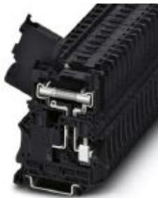
Lever-type fuse terminal block, black, for 6.3 x 32 mm G fuse inserts

Please be informed that the data shown in this PDF Document is generated from our Online Catalog. Please find the complete data in the user's documentation. Our General Terms of Use for Downloads are valid ( http://phoenixcontact.com/download )