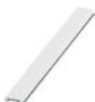
Zack Marker strip, flat, Strip, can be ordered: Strip, white, labeled according to customer specifications, mounting type: snap into flat marker groove, for terminal block width: 6.2 mm, lettering field size: 5.15 x 6.15 mm, Number of individual labels: 10

Zack Marker strip, flat - ZBF 6 CUS - 0825027