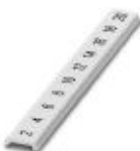
Zack Marker strip, flat, Strip, white, labeled, printed horizontally: consecutive numbers 2 ... 20, 22 ... 40, etc. up to 82 ... 100, mounting type: snap into flat marker groove, for terminal block width: 5 mm, lettering field size: 5.15 x 5.15 mm, Number of individual labels: 10

Zack Marker strip, flat - ZBF 5,LGS:GERADE ZAHLEN - 0810821