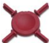
Coding star, length: 3 mm, width: 3 mm, height: 6 mm, color: red