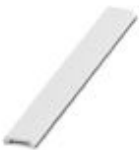
Zack Marker strip, flat, can be ordered: Strip, white, labeled according to customer specifications, mounting type: snap into flat marker groove, for terminal block width: 5 mm, lettering field size: 5.15 x 5.15 mm, Number of individual labels: 10

Zack Marker strip, flat - ZBF 5 CUS - 0825025