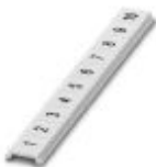
Zack Marker strip, flat, Strip, white, labeled, printed horizontally: consecutive numbers 1 ... 10, 11 ... 20, etc. up to 491 ... 500, mounting type: snap into flat marker groove, for terminal block width: 5 mm, lettering field size: 5.15 x 5.15 mm, Number of individual labels: 10

Zack Marker strip, flat - ZBF 5,LGS:FORTL.ZAHLEN - 0808671