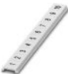
Zack Marker strip, flat, Strip, white, labeled, printed horizontally: consecutive numbers 1 ... 10, 11 ... 20, etc. up to 491 ... 500, mounting type: snap into flat marker groove, for terminal block width: 5 mm, lettering field size: 5.15 x 5.15 mm, Number of individual labels: 10

Zack Marker strip, flat - ZBF 5,LGS:FORTL.ZAHLEN - 0808671