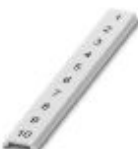
Zack Marker strip, flat, Strip, white, labeled, Printed vertically: consecutive numbers 1 ... 10, 11 ... 20, etc. up to 91 ... 100, mounting type: snap into flat marker groove, for terminal block width: 5 mm, lettering field size: 5.15 x 5.15 mm, Number of individual labels: 10

Zack Marker strip, flat - ZBF 5,QR:FORTL.ZAHLEN - 0808697