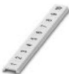
Zack Marker strip, flat, Strip, white, labeled, printed horizontally: consecutive numbers 1 ... 10, 11 ... 20, etc. up to 491 ... 500, mounting type: snap into flat marker groove, for terminal block width: 5 mm, lettering field size: 5.15 x 5.15 mm, Number of individual labels: 10

Zack Marker strip, flat - ZBF 5,LGS:FORTL.ZAHLEN - 0808671