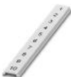
Zack Marker strip, flat, Strip, white, labeled, Printed vertically: consecutive numbers 1 ... 10, 11 ... 20, etc. up to 91 ... 100, mounting type: snap into flat marker groove, for terminal block width: 5 mm, lettering field size: 5.15 x 5.15 mm, Number of individual labels: 10

Zack Marker strip, flat - ZBF 5,QR:FORTL.ZAHLEN - 0808697