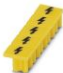
Warning cover, 5-pos., for terminal width: 5.2 mm

Zack Marker strip, flat - ZBF 5 CUS - 0825025