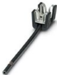
Shield connection clamp, color: black

Please be informed that the data shown in this PDF Document is generated from our Online Catalog. Please find the complete data in the user's documentation. Our General Terms of Use for Downloads are valid ( http://phoenixcontact.com/download )