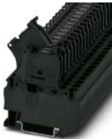
Lever-type fuse terminal block, color: black, for 5 x 20 mm G fuse inserts, with LED for 250 V AC

Please be informed that the data shown in this PDF Document is generated from our Online Catalog. Please find the complete data in the user's documentation. Our General Terms of Use for Downloads are valid ( http://phoenixcontact.com/download )